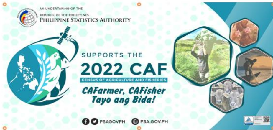
'Streamer (tarpaulin), landscape, 4 x 8 (ft), 6 pin holes