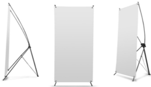
'X Banner Stand Frame, 2 feet x 5 feet (Vertical Display), Interchangeable Banner, Adjustable & Compact Fold Material, with carrying bag