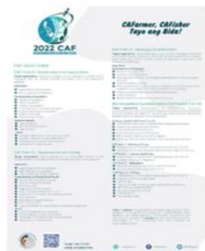
'Flyers, back to back , 8.5 x 11, glossy