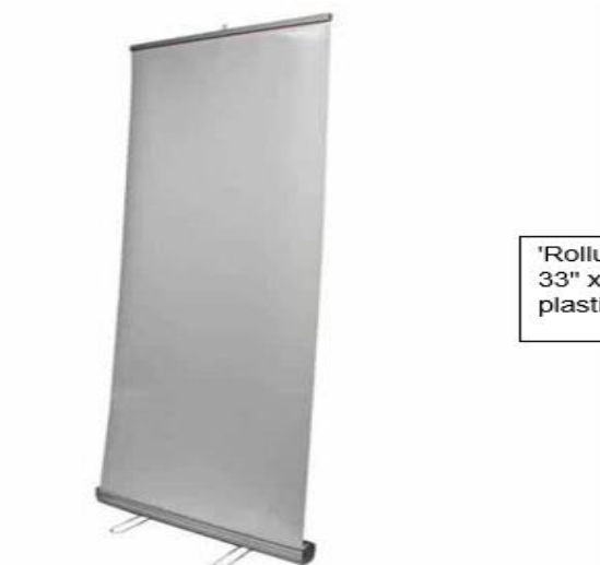
'Rollup banner (Stand), portrait, retractable, 33" x 78", combination of aluminum and plastic base