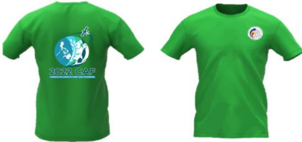
T-shirt, at least 80% cotton, green, various sizes w/ CAF Logo and print "2022 Census of Agriculture and Fisheries", type of print: heat press printing