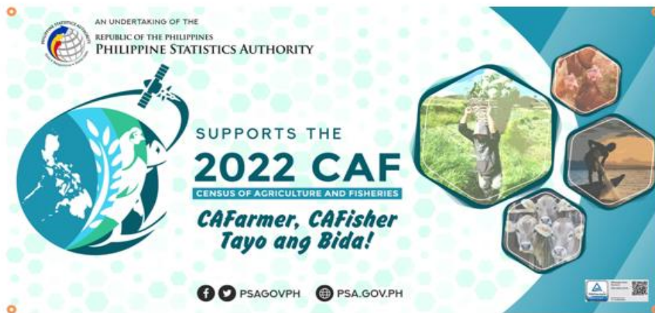
'Streamer (tarpaulin), landscape, 3 x 6 (ft), 4 pin holes