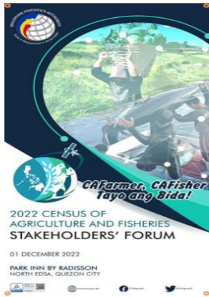
'Standeas (tarpaulin for X Banner), portrait, 2 x 5 (ft), 4 pin holes