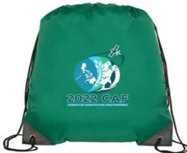
'Bag, foldable drawstring backpack, w/ CAF Logo, material: canvas, 5kg capacity, approximately 40 cm x 34 cm