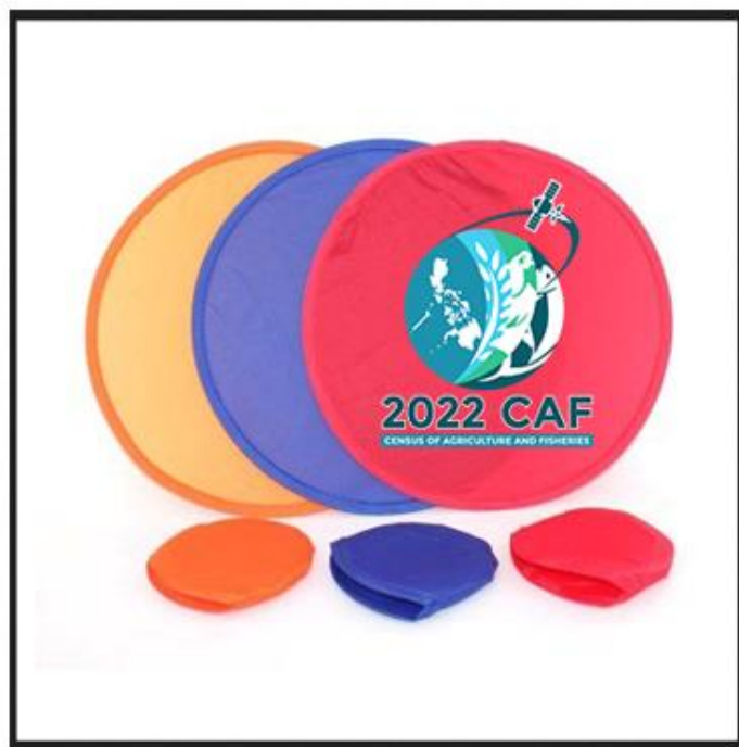
'Foldable twisted Fan, w/ CAF Logo