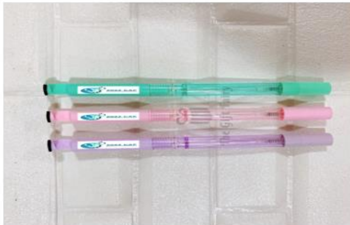
'Personalized Pen, 3 in 1, (pen, alcohol dispenser, cellphone holder), w/ CAF Logo and print "2022 Census of Agriculture and Fisheries"