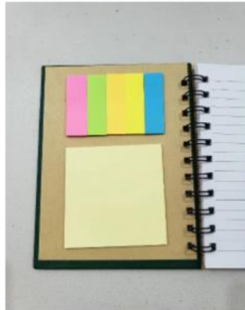
Eco flip top notebook with sticky notes and pen, spiral notebook, hardcover magnetic flip top, approximately 5" W x 6.5" H, at least 70 pages, with small print CAF Logo and "2022 Census of Agriculture and Fisheries" on flip cover, and large print PSA name and logo and "2022 Census of Agriculture and Fisheries" in main cover, main cover color: green