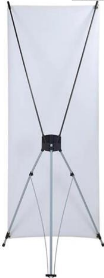
2022 CAF Standee with Tripod banner stand 24 in. x 60 in., polyester/polyethylene/polyurethane Tripod banner stand material: Aluminum/ABS Dimensions: 60 cm. x 160 cm.