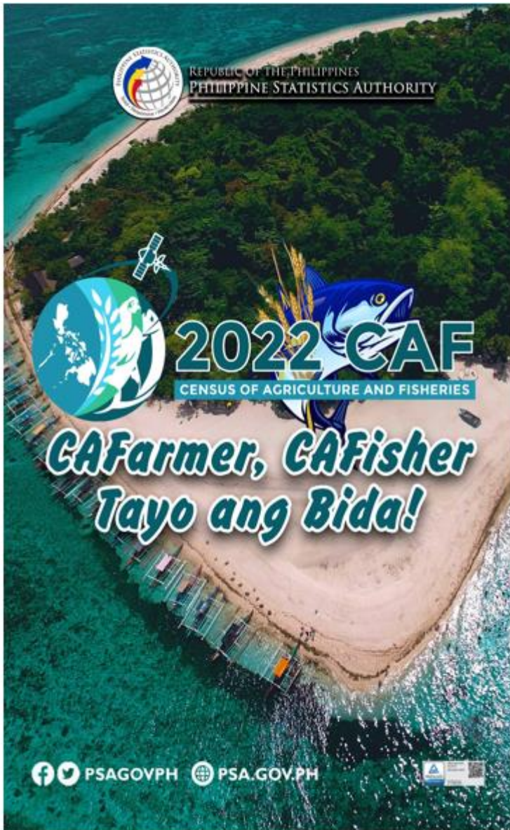
2022 CAF Poster 20 in. x 30 in., poster paper