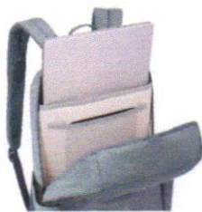
Elevated padded pocket safeguards a 15.6" PC