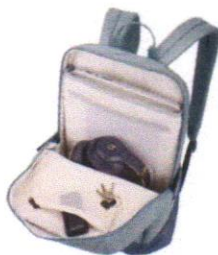
Zippered interior mesh pocket allows you to locate accessories easily