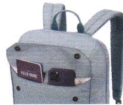
Front pocket organization panel allows you to quickly access a phone, pens, keys, and other small accessories