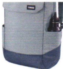
Side pockets provide easy access to water bottles or other smaller items