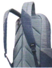
Padded back panel and shoulder straps create a comfortable carry