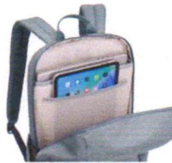
A dedicated slip pocket protects up to a 10.5" tablet