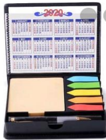
Sticky note set with box