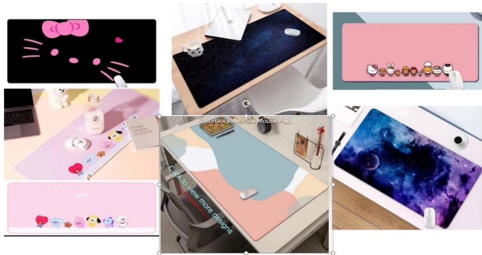
Extended PC Mouse Pad