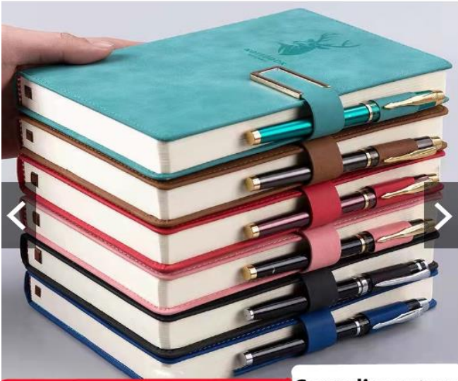
Extra thick Page 416 Complimentary signature pen