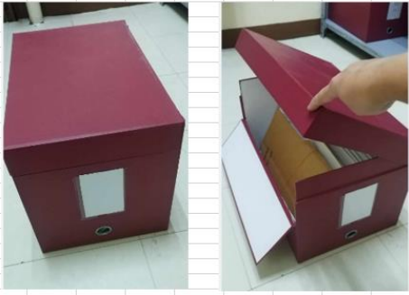
Magazine Storage Box with Lid Cover, Maroon