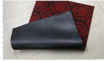
Doormat, carpet, anti-slip