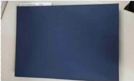
Hardbound folder, expandable, long with plastic label