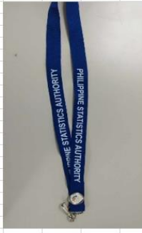
PSA ID Lace w/ print and Logo