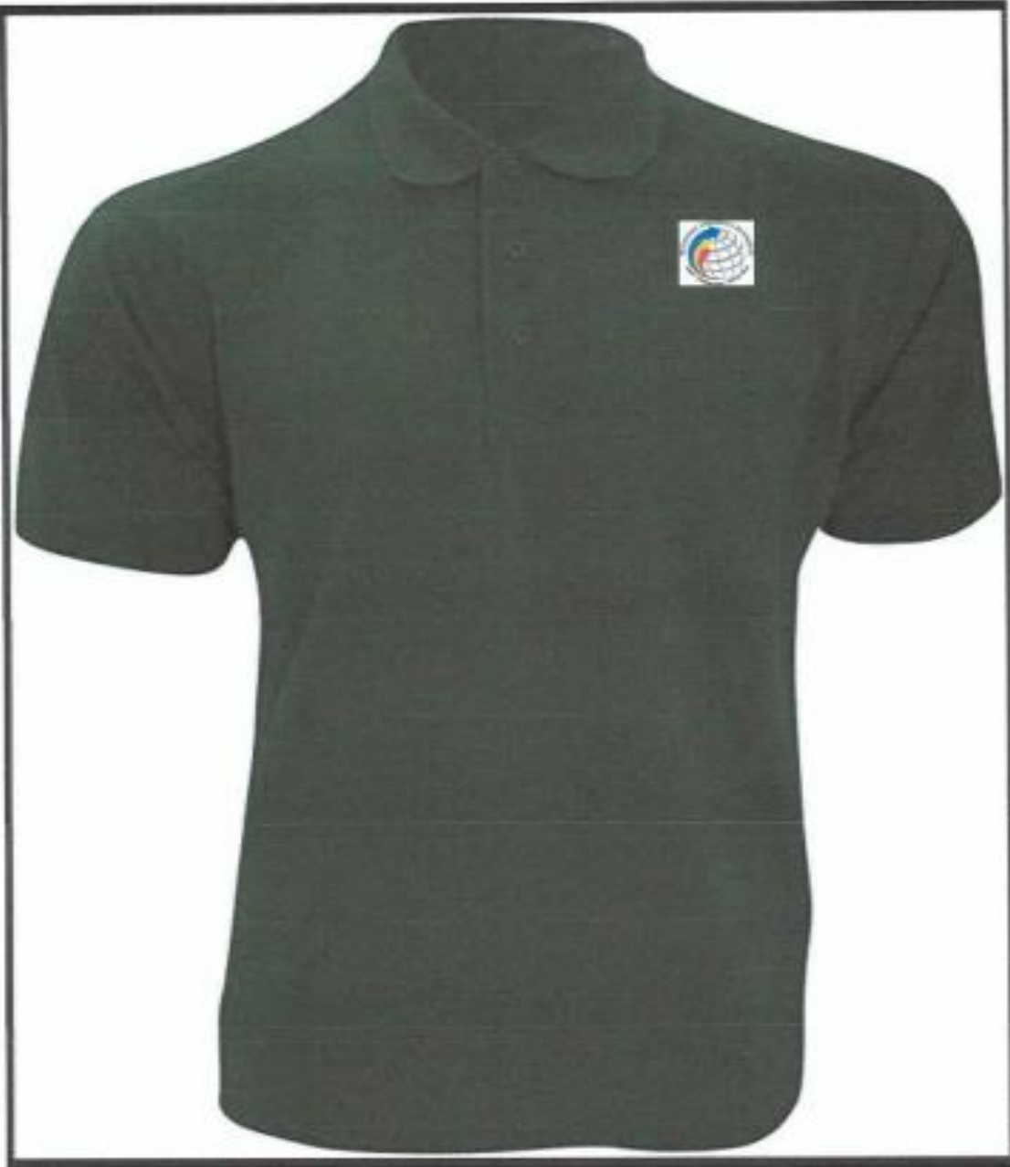
2021 ASB1 Logo Army Green