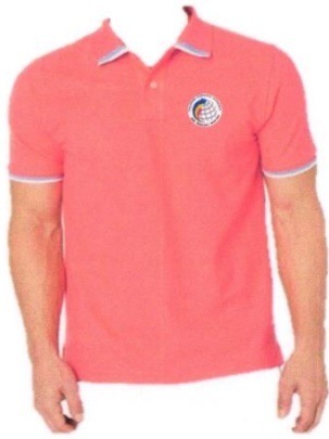
Peach with light blue white trimmings