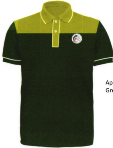
Apple Green/Emerald Green combination