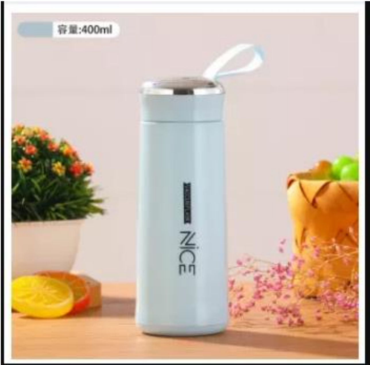
Tumbler Size: 400ml With PSA Logo Color: Blue, Light blue, yellow