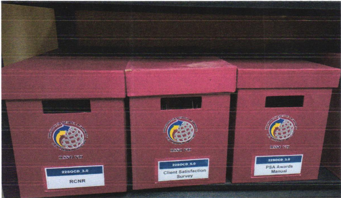
DATAFILE BOX, with detached cover for legal size documents and with PSA logo (approximately LxWxH 16'x7.25"x10inches)