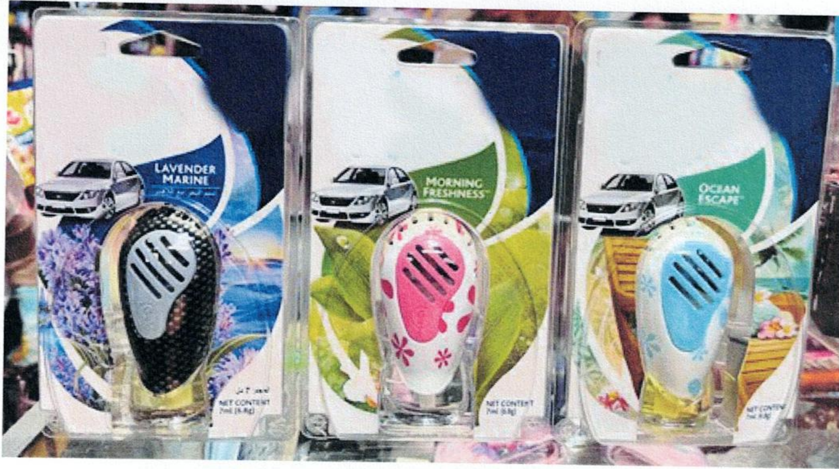
Car Freshener, 7ml