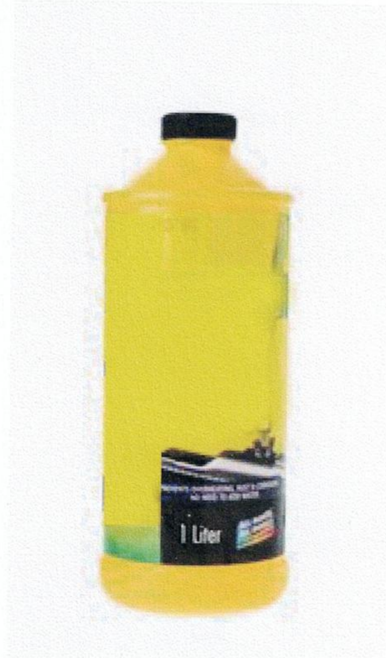
Coolant, 1 liter