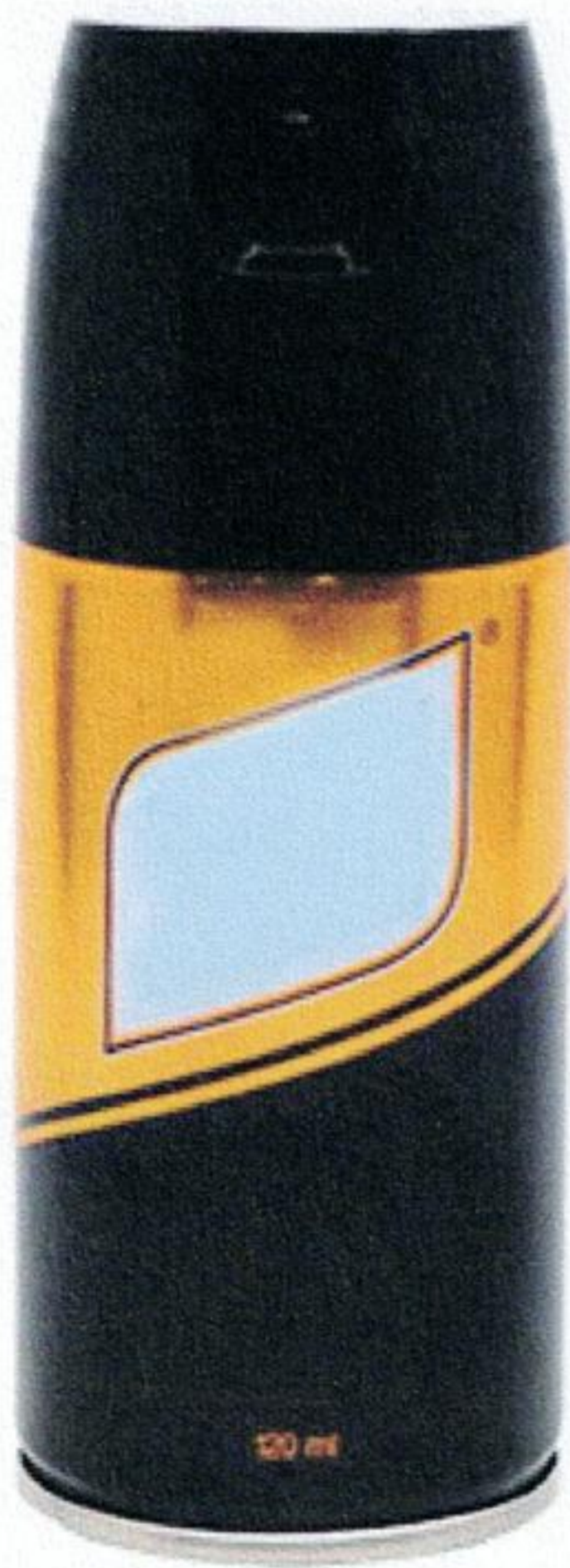
VS1 Protector Spray, 120 ml