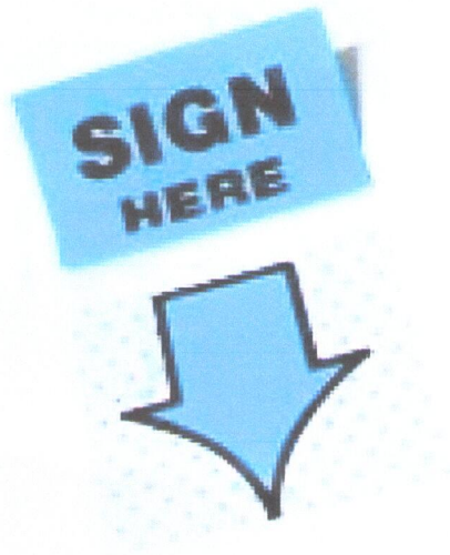
Marker Stickers Pointing to Signature Lines