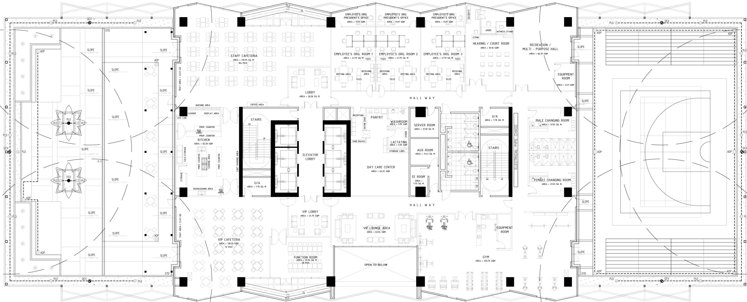
PSA 23-STOREY BUILDING 7TH FLOOR DRAINAGE AND IRRIGATION LAYOUT SCALE 1:100M

PURSUANT TO SECTION 4 OF ANNEX "A" OF THE REVISED IMPLEMENTING RULES AND REGULATION OF R.A. 9164, APPROVAL BY THE AUTHORIZED DPWH OFFICIALS OF DETAILED ENGINEERING SURVEYS AND DESIGN UNDERTAKEN BY CONSULTANTS NEITHER DIMINISHES THE RESPONSIBILITY OF THE LATTER FOR THE TECHNICAL INTEGRITY OF THE SURVEYS AND DESIGN NOR TRANSFER ANY PART OF THAT RESPONSIBILITY TO THE APPROVING OFFICIALS.